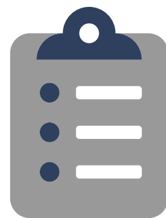
PREPARING & MAINTAINING WORK ENVIRONMENTS