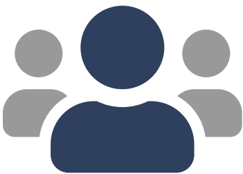
EDUCATION OF STAFF

Although there are many aspects to providing a successful return back to business in a safe and healthy manner, the three main topics are: